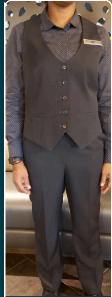
SILVER NOTE UNIFORM