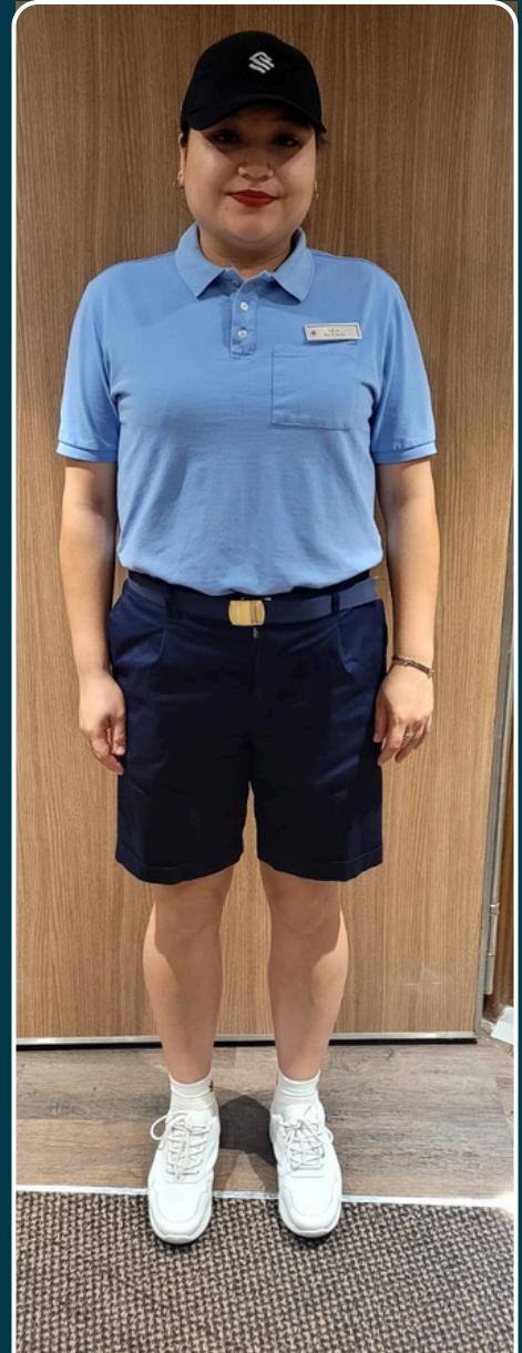
POOL UNIFORM HOT WEATHER