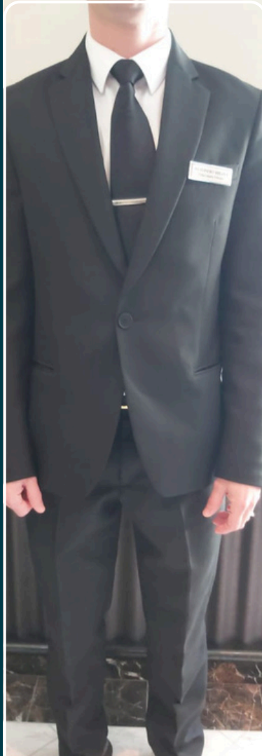
LA DAME UNIFORM