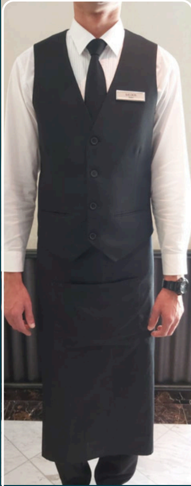
LA DAME UNIFORM