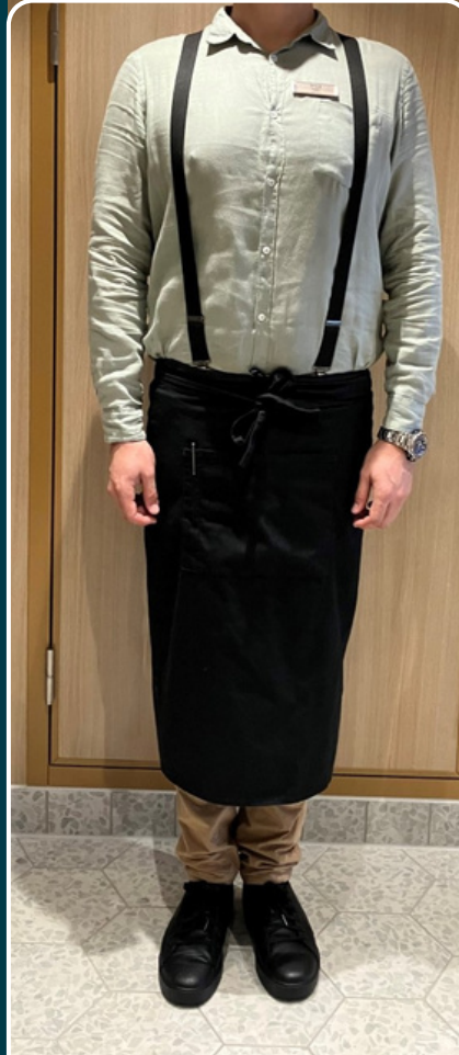
MARQUEES NIGHT UNIFORM