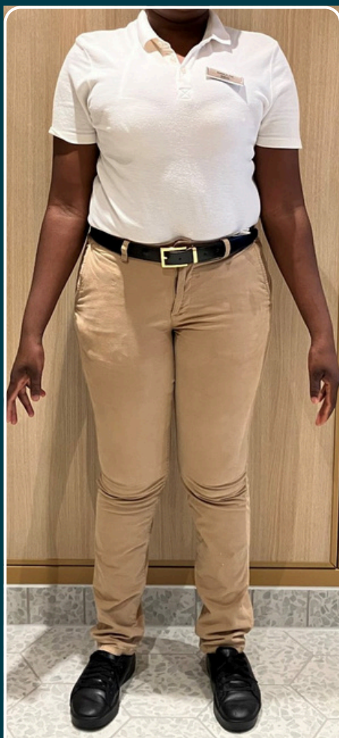
MARQUEES DAY UNIFORM