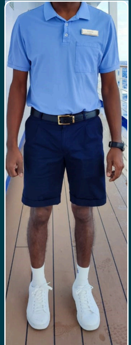
POOL UNIFORM HOT WEATHER