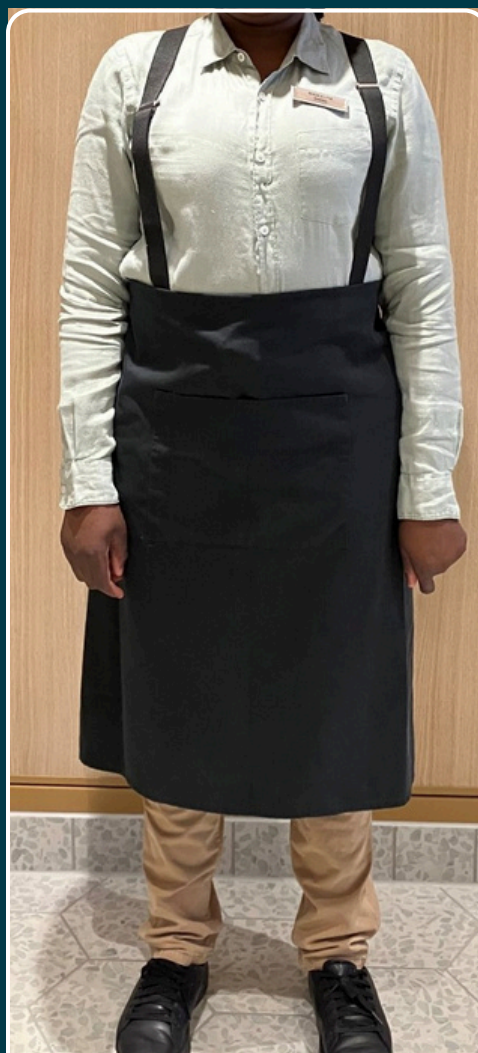
MARQUEES EVENING UNIFORM