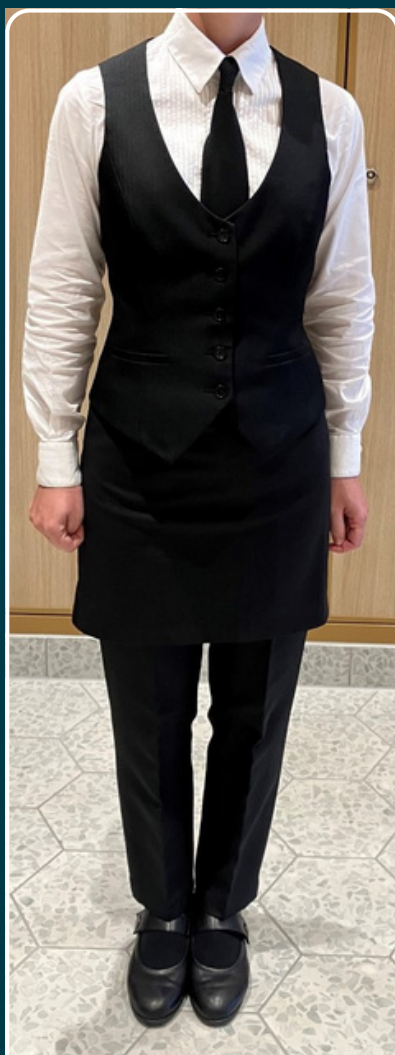
UNIFORM WITH APRON