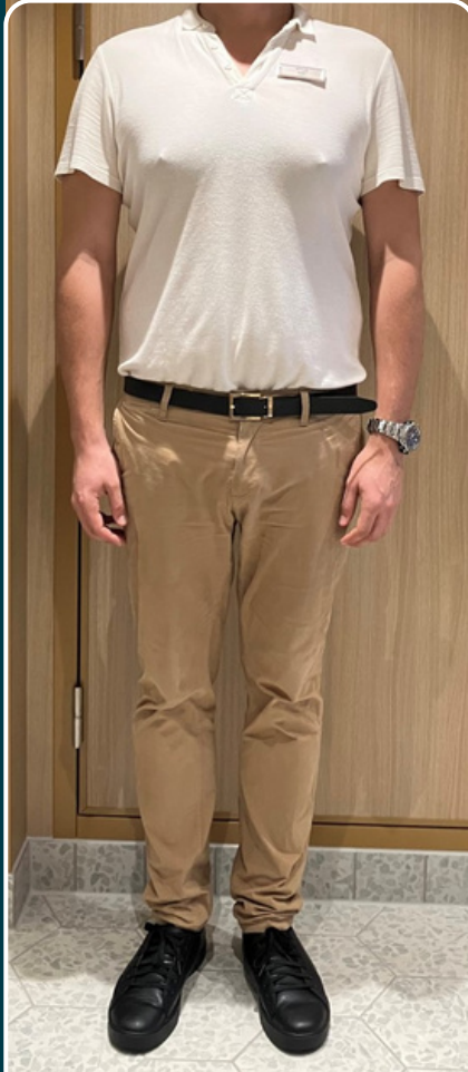
MARQUEES DAY UNIFORM