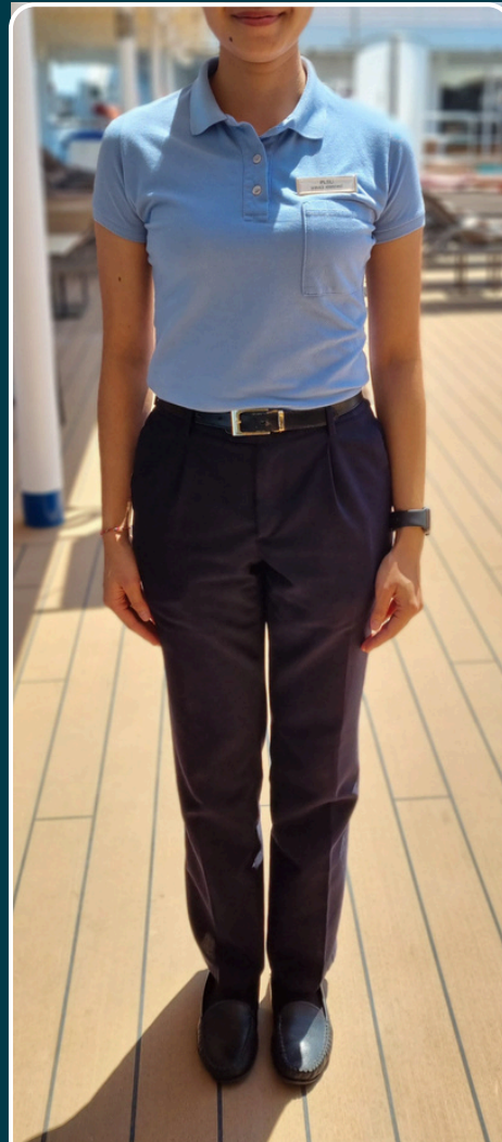
BAR WAITRESS PANTS UNIFORM